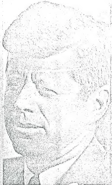
John F. Kennedy